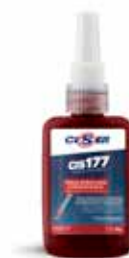
Traba Rosca Alto Torque Cis