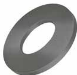
Arandela Plana s/ Recubrimiento