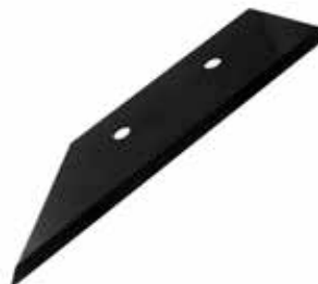
Reja p/ Arado