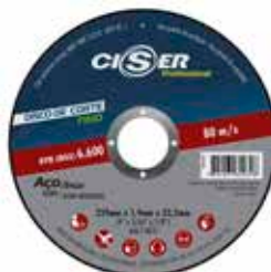
Disco Corte Pro

TA1P00104100 115MM G40 TA1P00105100 115MM G60 TA1P00106100 115MM G80 TA1P00107100 115MM G120