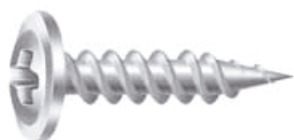
Tornillo Punta Aguja p/ PVC Chino

TA35456301 4,2 x 13 TA35456801 4,2 x 19 TA35457101 4,2 x 25 TA35457301 4,2 x 32 TA35457501 4,2 x 38