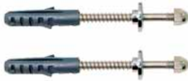
Tornillo C/ Tarugo Zincado P/ Water

TA1B00410001 12MM x 10M TA1B00420001 18MM x 10M TA1B00420002 18MM x 25M TA1B00420003 18MM x 50M