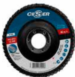
Flap Disc STD

TA1P00104100 115MM G40 TA1P00105100 115MM G60 TA1P00106100 115MM G80 TA1P00107100 115MM G120