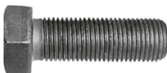
Bulón Acero G5 NF