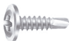
Tornillo Autorroscante Ciser