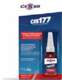
Traba Rosca Alto Torque Cis