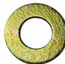
Arandela Plana Zincado