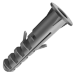
Tarugo C/ Tope

TA44825100 N° 6 TA44835100 N° 8 TA44840100 N° 10 TA44845100 N° 12