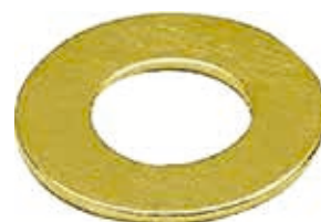
Arandela Milim. Bricrom