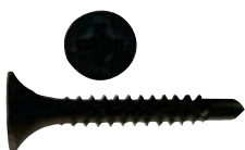
Tornillo Punta Mecha Negro