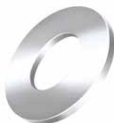
Arandela Plana Zincado Blanco