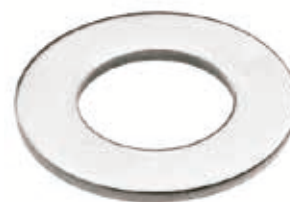
Arandela Lisa Inox.