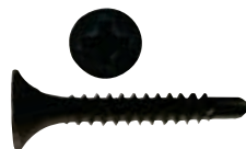
Tornillo Punta Mecha Negro