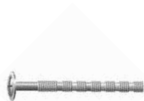
Tornillo P/ Tirador