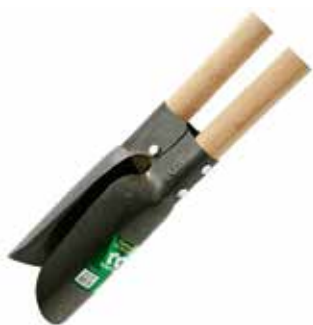
Pala Excavadora Grande Ref60