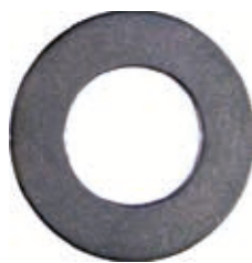
Arandela Lisa Ciser