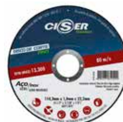
Disco Corte STD

TA1P10104100 115X1,0X22 TA1P10108100 180X1,9X22 TA1P10115100 230X1,9X22