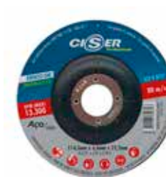
Disco Desbaste Pro

TA1P10309100 180x3,2x23 TA1P10316100 230x3,2x23 TA1P10319100 300x3,2x25