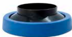
Anillo Vedacion Sanit c/ Guia