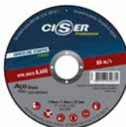
Disco Corte Pro

TA1P10208100 180X1,9X22 TA1P10215100 230X1,9X22