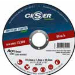
Disco Corte Pro

TA1P10104100 115X1,0X22 TA1P10108100 180X1,9X22 TA1P10115100 230X1,9X22