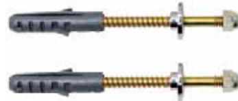
Tornillo c/ Tarugo Bicromatizado p/ Water