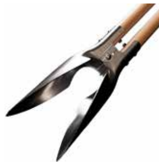
Pala Excavadora Hercules