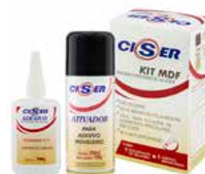
Kit Adhesivo p/ MDF